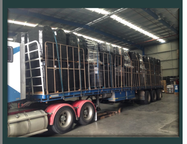
Cupolex delivered to site with Reo steel

Cupolex Dome slabs for 17 homes on 1 truck