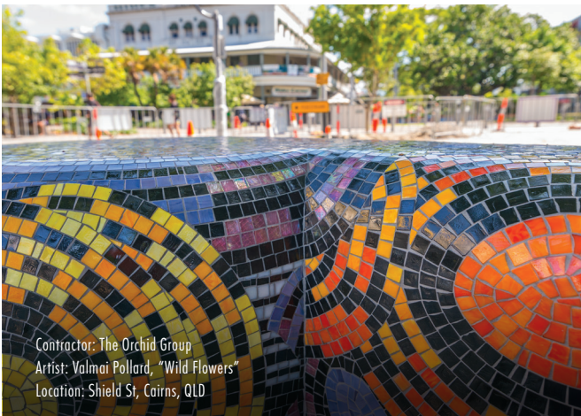
Contractor: The Orchid Group Artist: Valmai Pollard, "Wild Flowers" Location: Shield St, Cairns, QLD