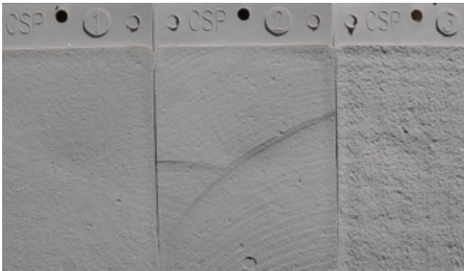
CSP1 to CSP3

For coloured adhesives mix with 2 boxes (4 individual pigment pouches) of PERMACOLOR® Select pigment packs for each 20 kg bag of 254 adhesive, White only. Check to ensure colour match and acceptability with grout prior to use.