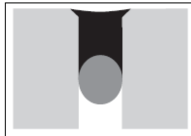
Flush joint design rules out trip hazards and dirt traps

Backing: Use closed cell, polyethylene foam backing rods.