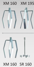
Tool set 1*